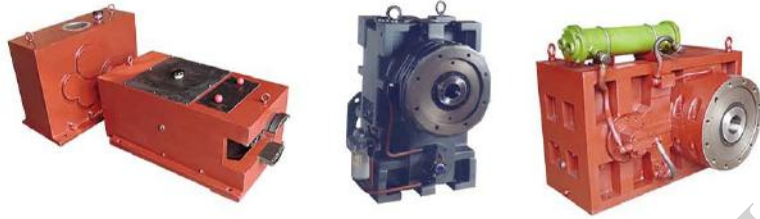
单螺杆挤出机减速机 (选购) 推荐参数